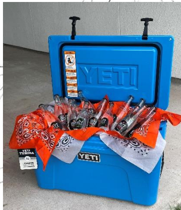
Yeti 45 w/Sparkling Water