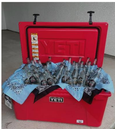
Yeti 65 w/Sparkling Water

No, you don't need to be there to win. Yes, you can buy more tickets when you are there eating the delicious BBQ.